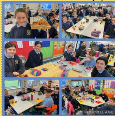
5th class enjoying a French breakfast treat.