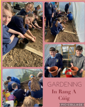
GARDENING In Rang A Cúig PIC-COLLAGES