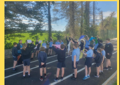
4th class learning French in the sunshine!